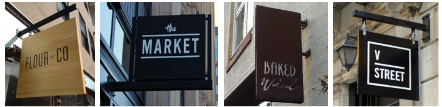
Sign Type C Blade Signs