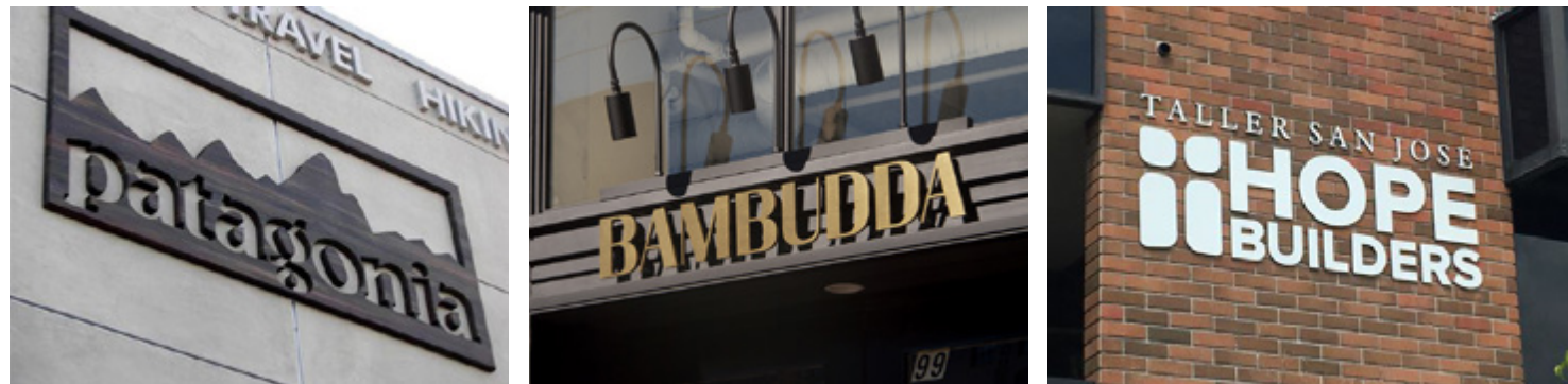
Sign Type B Building Signs