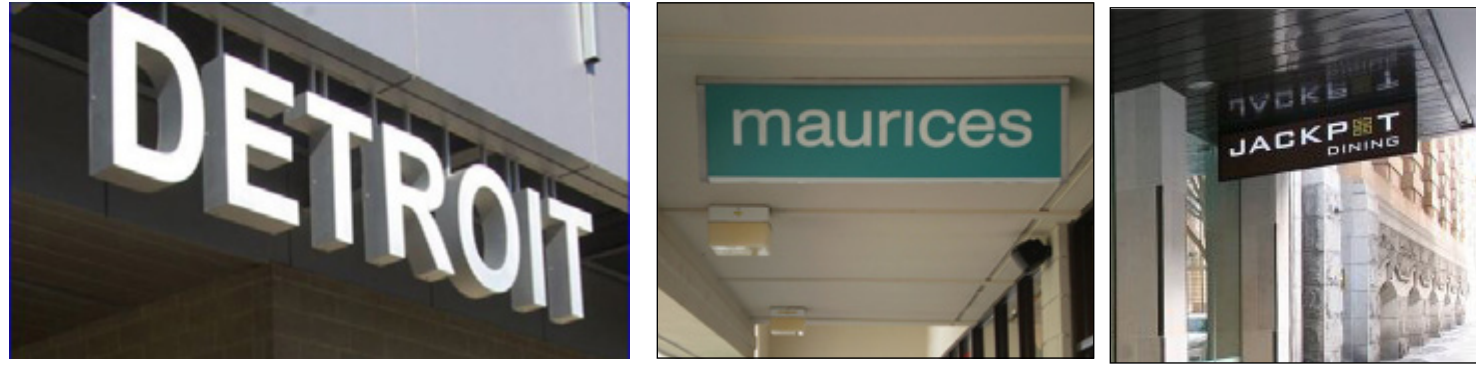
Sign Type A Marquee Signs